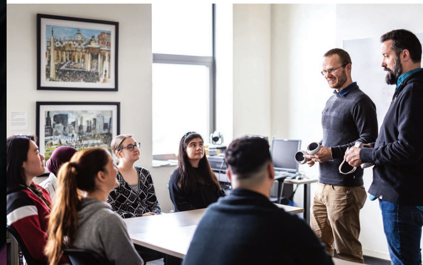
A biology and a philosophy professor teach a joint course about emerging technologies.