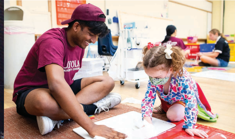
Loyola student volunteers at a Chicago school.